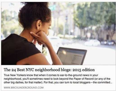
The 24 Best NYC neighborhood blogs: 2015 edition True New Yorkers know that when it comes to ear-to-the-ground news in your neighborhood, you'll sometimes need to look beyond the Paper of Record (or any of the other big dailies, for that matter). For that, you can turn to local bloggers—the committed... WWW.BRICKUNDERGROUND.COM

NAMED ONE OF THE BEST NYC NEIGHBORHOOD BLOGS IN 2015